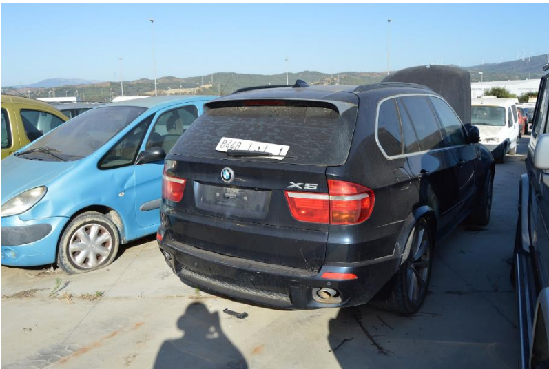
MCA 30-20 (8448-D-1)